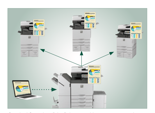
Standard Serverless Print Release enables users to securely print a job and release it from up to six supported models on the same network.