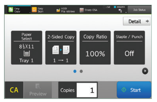
Easy Copy Screen offers the most commonly used settings.