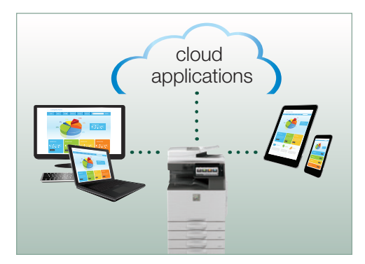
Access popular cloud applications, distribute files and print documents more easily.