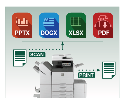
Scan and convert documents to popular file types with optional OCR Expansion Kit.